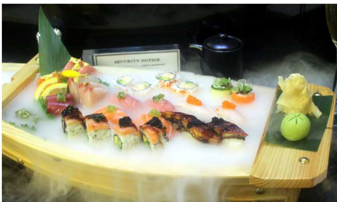
A steaming boat of Sushi and Sashimi!

Pan Chai makes for an excellent people watching spot, and there is plenty to see in Harrods. With this we had our back turned when our waiter came over. With a little cough to bring us back round, we were stunned. Toto, I don't we are in Itsu anymore!