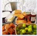
Puglia... a gourmet's paradise