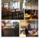
Lunch in the City: back at The Anthologist