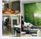
A girly lunch at Cuisine de Bar by Poilâne